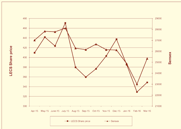
LECS Share price vs BSE Sensex

The equity shares of the Company are not suspended from trading in BSE Limited.